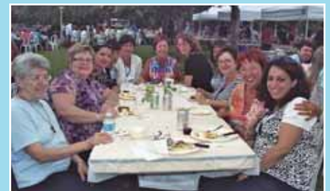
Next year should be even more fun!

HR even devised a little game where colleagues got to meet and greet other colleagues. At game's end, the objective had been achieved – Faces matched names and names matched faces!