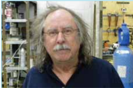
Michel Goulet, creator of the work of art

The Institut acquired this work of art during the expansion work done between 1994 and 1996 that resulted in the creation of the Saputo pavilion.